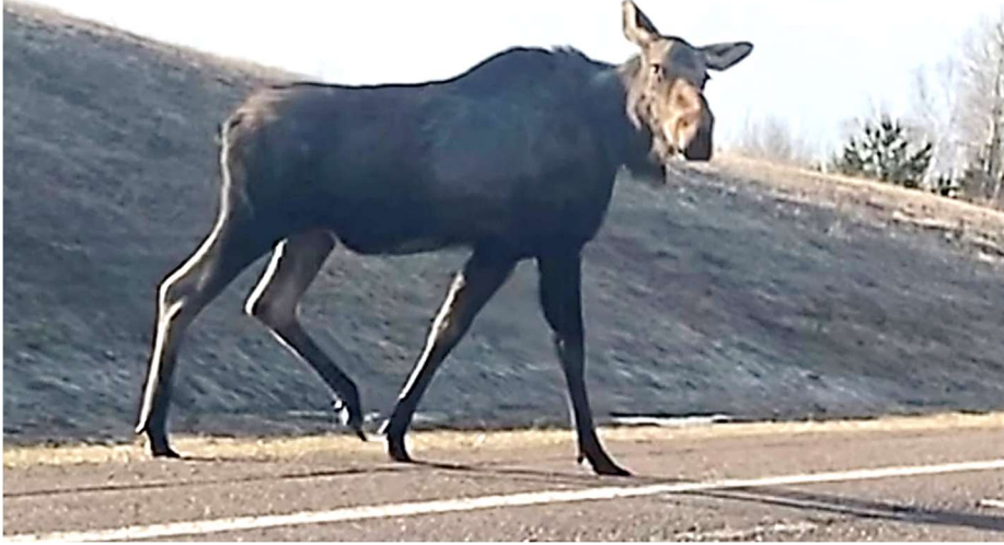
Silver Creek Moose spotted on Highway 3 by Jody Reineccius.