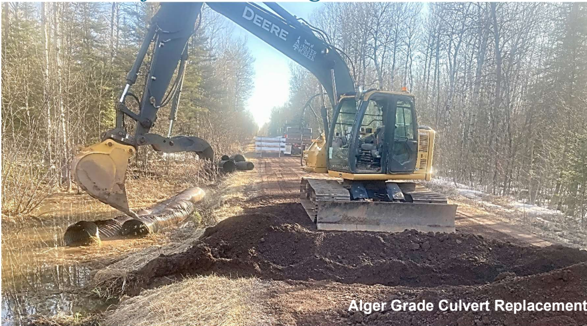
Alger Grade Culvert Replacement