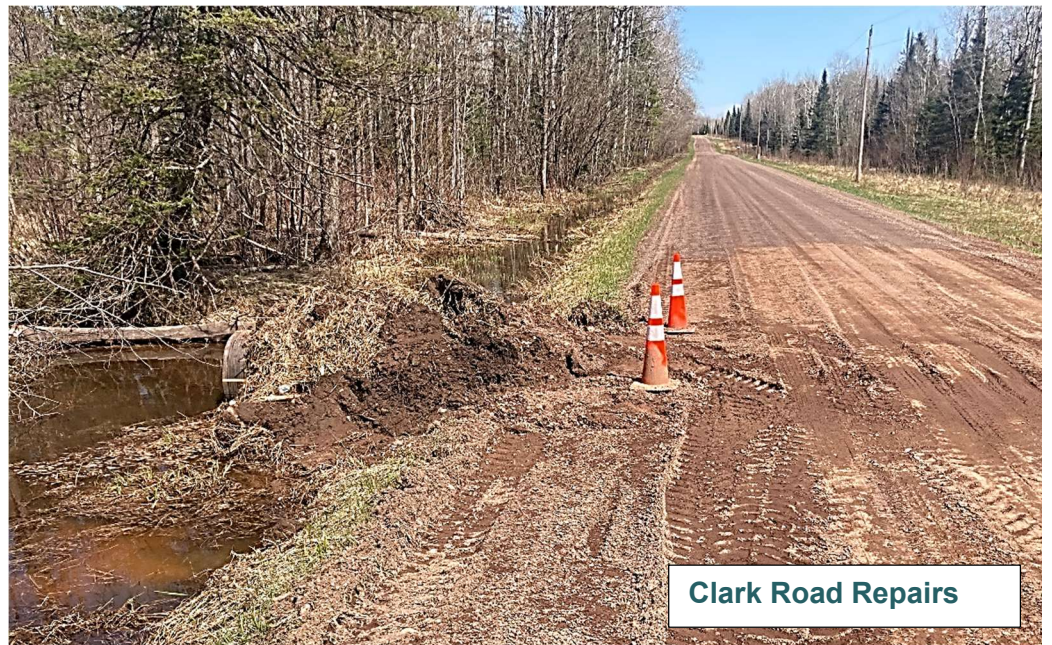
Clark Road Repairs

The County was forced to close Highway 3 at the southern end due to damage sustained at the Silver Creek Tributary in the May 12 th flooding rain event.