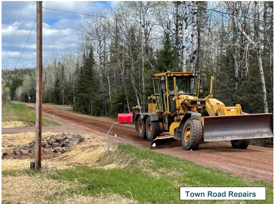
Town Road Repairs

The snow over mud experienced every week of April was very tough on the roads. Some culverts could not be found or kept re-freezing after being opened. This led to water backing up in the ditches. The rain event on May 12 th didn't help. On Clark Road, a couple of culverts disintegrated and had to be replaced (shown front page and at lower right). Some additional repairs will be needed on Clark Road. On Town Road at Bob Skogen's driveway, a lake had formed. After excavation, and clearing the culverts, the right-of-way had to be repaired and new riprap applied.