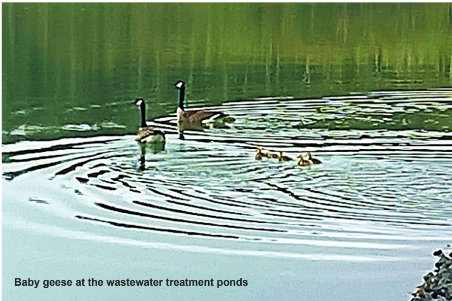
Baby geese at the wastewater treatment ponds

The Town's grader is a 1996 model with a fair bit of wear and tear. Only smaller repairs have been needed in recent years, but it did require $40,000 in repairs in 2018. Both Thompson and Reineccius have worked to minimize the use of the grader in winter and to keep up with maintenance to prolong its life. The Town has been considering road groomers to try to determine whether they could be used for some road conditions or serve as a backup to the grader.