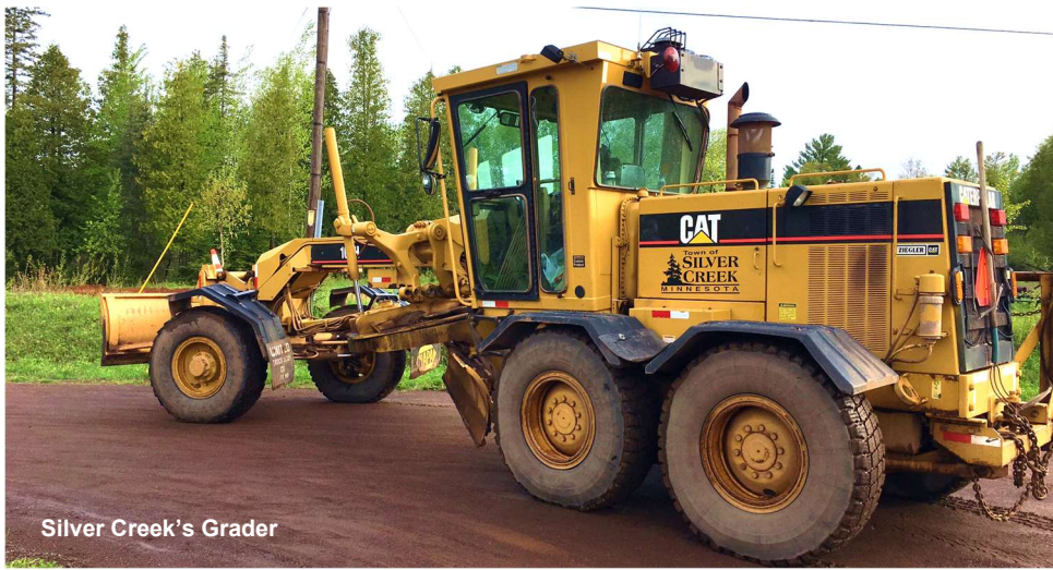
Silver Creek's Grader