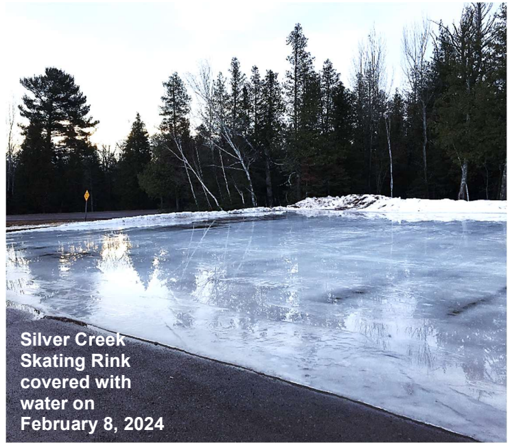
Silver Creek Skating Rink covered with water on February 8, 2024

After learning of an organization who lost $800,000 to a phishing scam, and attending training on cyber security issues, Town Supervisors decided to institute some new safeguards. A cybercrime insurance policy has been purchased that helps cover costs in the event that the Town website were to be hijacked or other cybercrime experienced. The Town also worked with the Bank to ensure that all available security measures are in place. At the bank's suggestion, the Town has instituted two programs that safeguard against check fraud and/or illegal wire transfer of Town funds. An electronic file is sent to the bank each time town checks are issued. This prevents stolen or forged checks from being cleared by the bank. The ACH filter allows electronic debits only to a pre-authorized list of vendors. Currently the Town uses electronic payment only to government entities including Minnesota Revenue, the IRS and the Public Employees Retirement Association.