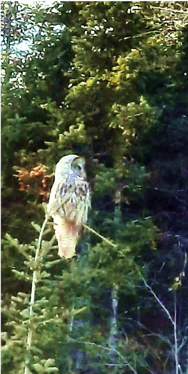
Great Gray Owl

Welcome to the SILVER CREEK SOURCE . This newsletter is also available on ttosc.org . If you would prefer to receive the newsletter via email, send request to silvercreek@frontiernet.net .